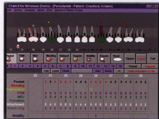
Chart-It is also available in British and Canadian versions.